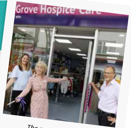
The reopening of our Warners End shop

Last summer, Rennie Grove's Warners End shop reopened as a community hub and our Harpenden branch was refreshed to become a Revalued Outlet. Autumn also saw the arrival of our second boutique – this time in Berkhamsted.