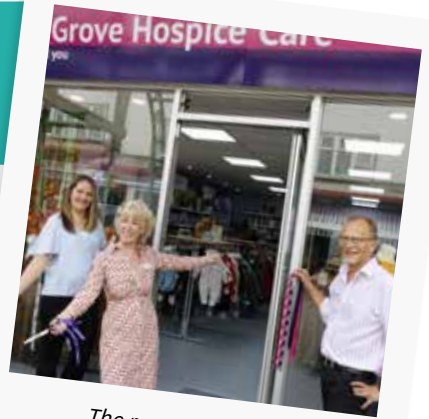
The reopening of our Warners End shop

Last summer, Rennie Grove's Warners End shop reopened as a community hub and our Harpenden branch was refreshed to become a Revalued Outlet. Autumn also saw the arrival of our second boutique – this time in Berkhamsted.